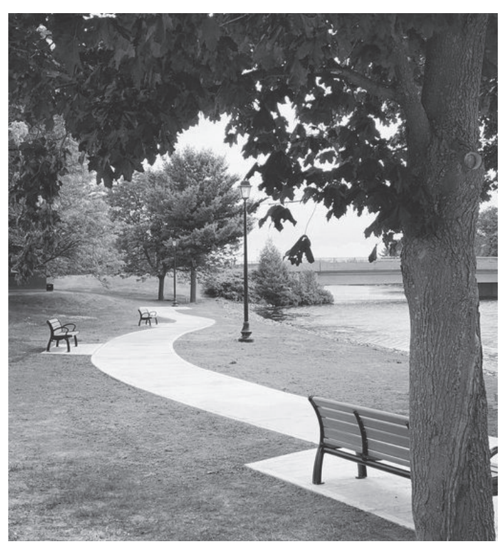
Blind River Receives Funding For The Waterfront

Prizes include $50 for each category, each age group x6 =$300, and that money will be donated in the winners' names to the two refugee families coming to Espanola from Ukraine.